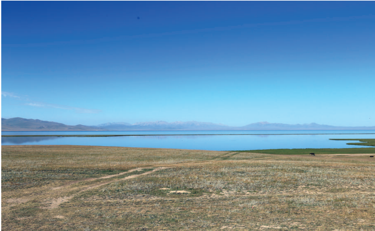
Son-Kul Lake, Kyrgyzstan