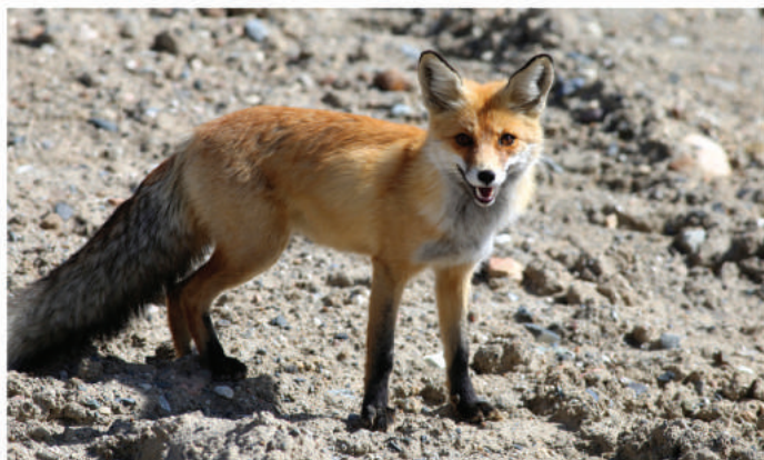
Representatives of the fauna in the wetlands of the Tengiz-Korgalzhyn Lakes system and the Issyk-Kul Lake