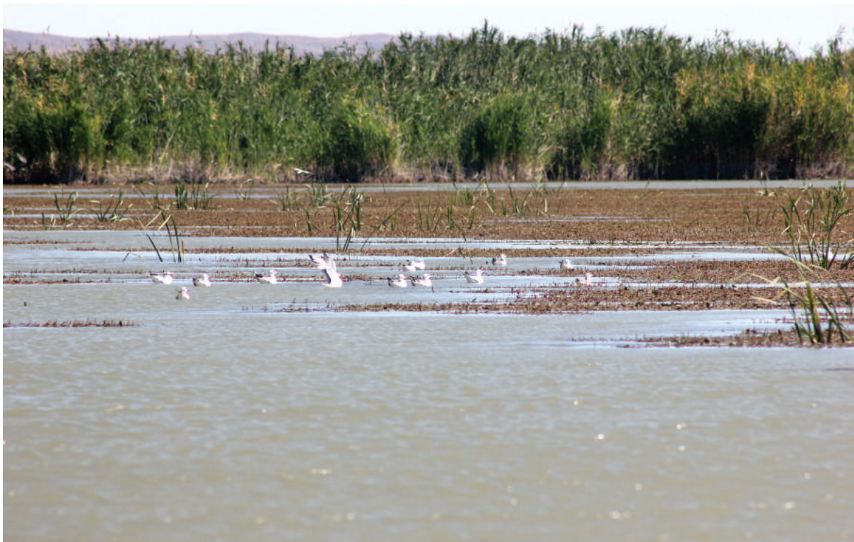
Alakol-Sassykkol Lake system, Kazakhstan

Kazakhstan. Kazakhstan joined the Ramsar Convention on 2 May 2007 and has 10 Ramsar Sites at present. Besides, five potential wetlands have been identified for the inclusion in the Ramsar List in the years 2018-2021.