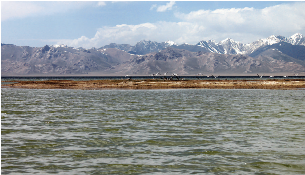
Chatyr-Kul Lake, Kyrgyzstan