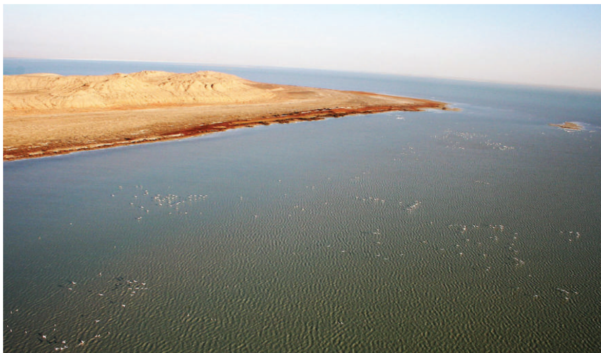
The north-east part of the Turkmenbashi Bay, Turkmenistan

Turkmenistan. Turkmenistan became a party to the Ramsar Convention in July 2009, and so far, nominated only one Ramsar area – the Turkmenbashi Bay. Nevertheless, as far back as 2010, under the State Commission for ensuring the implementation by Turkmenistan of its obligations resulting from the UN Conventions and Programs on the Environment, a Working Group has been created for monitoring the implementation of the provisions of the Convention in the country and the management of the wetlands, which are already entered and will be entered into the Ramsar List in the future.