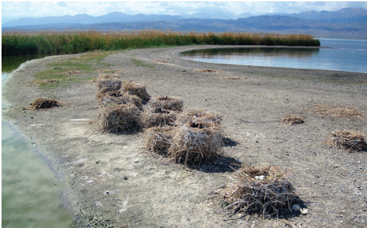
Nests of cormorants on the western shore of the Issyk-Kul Lake, Kyrgyzstan