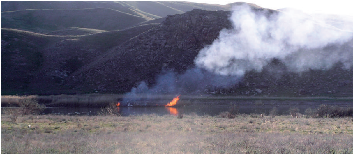
Fire in the steppe, Kazakhstan