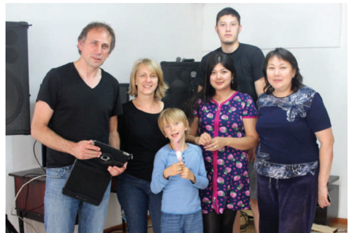
From top to bottom

The yurt town for tourists at the Son-Kul Lake, Kyrgyzstan