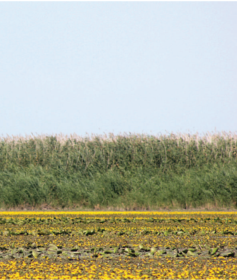
Alakol-Sassykkol Lake system, Kazakhstan