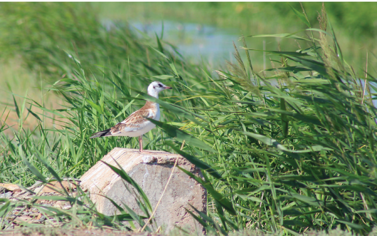
Tengiz-Korgalzhyn Lake system, Kazakhstan