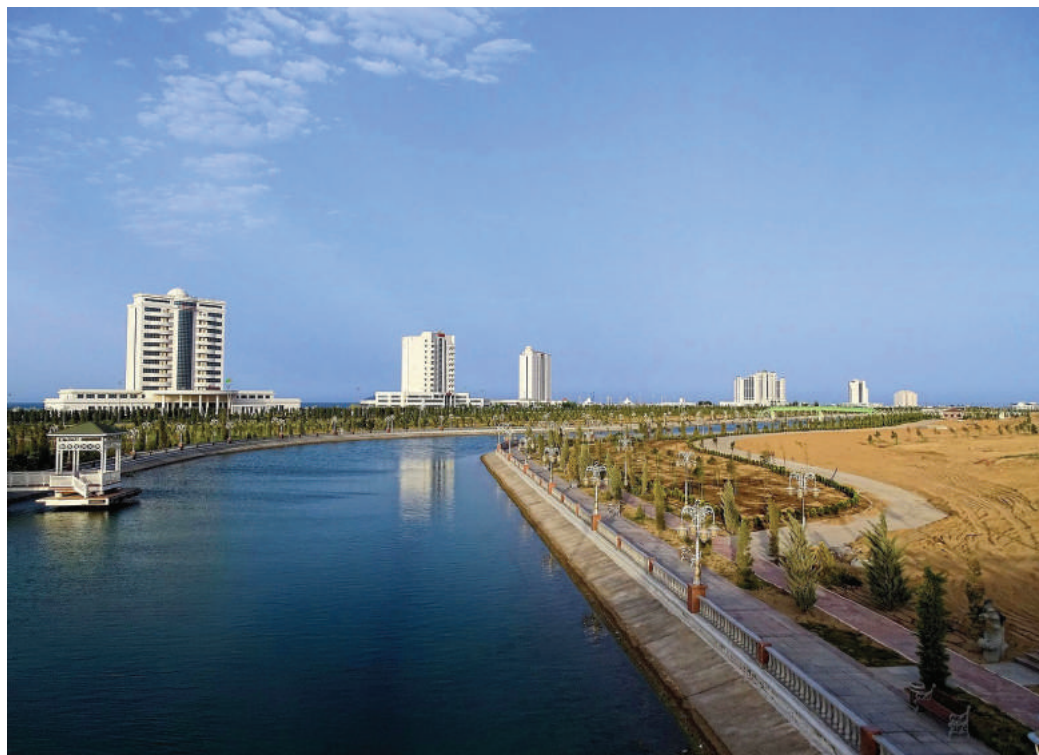
National tourist zone "Avaza", Turkmenistan Turkmenbashy Bay, Turkmenistan