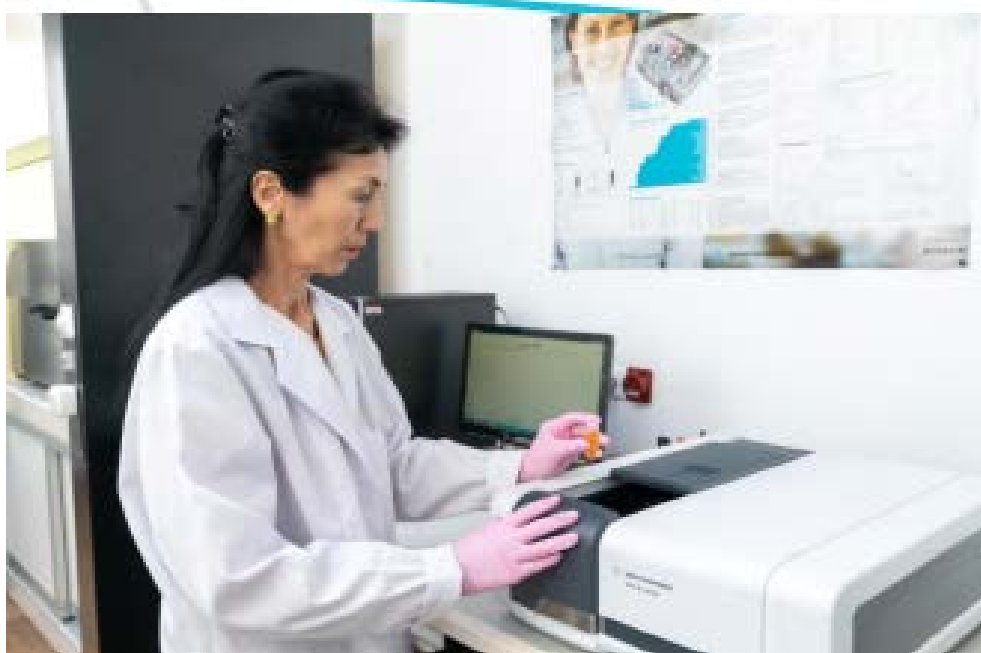
Picture 2: Pilot recycling of the sediment at Kazakh laboratory in Almaty (March 2022)

The demo project has passed many milestones for the last 1.5 years of its implementation. The most important is the identification of innovative solutions to address the sedimentation challenge at the Ruslovoe reservoir. The remaining half a year before the end of the project will be dedicated to the finalization of the technical solutions on how to clean the sediments from the reservoir. Until now, the national and international experts have come up with around 10 technical suggestions that include different technologies and vendors. Moreover, a cost and benefit analysis (CBA) will be done to support the decision makers in their conclusions on the investments required and the technical solutions identified.